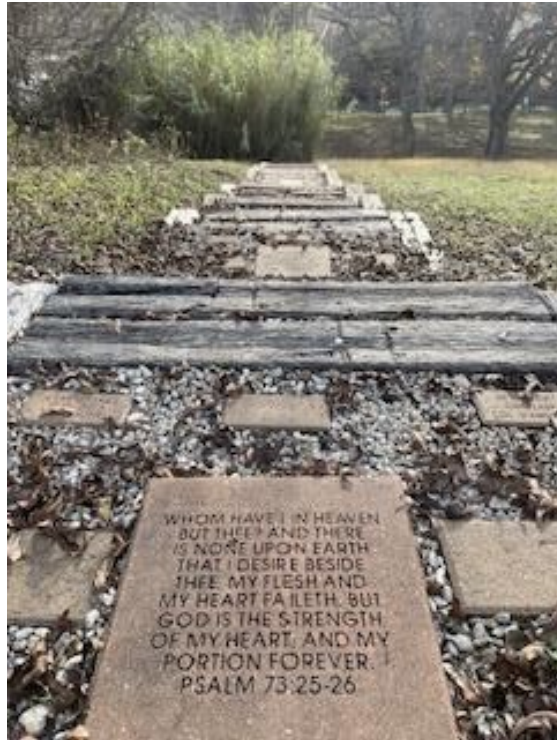
Steps on the way to the river

While all those behaviors have persisted through the ages, gone are the days when pastors struggled with divorce, premarital pregnancies, and cohabitation. Now a typical Christian leader is called to help people face: